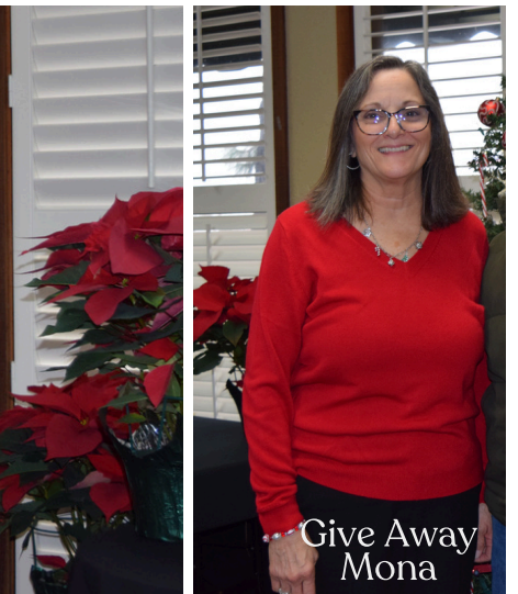
Give Away Mona